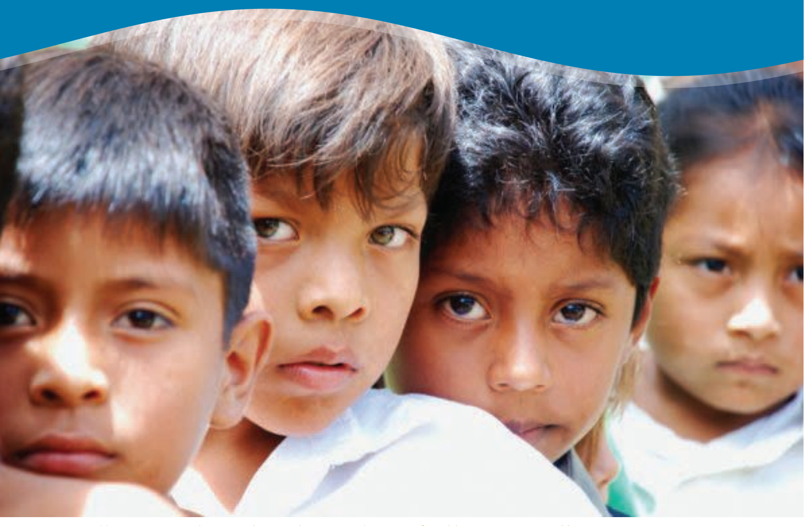
"Go and make disciples of all nations" Matthew 28:19